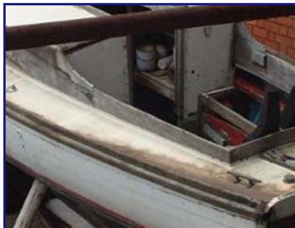
Our Puffin today or let's call her Puffin (3)