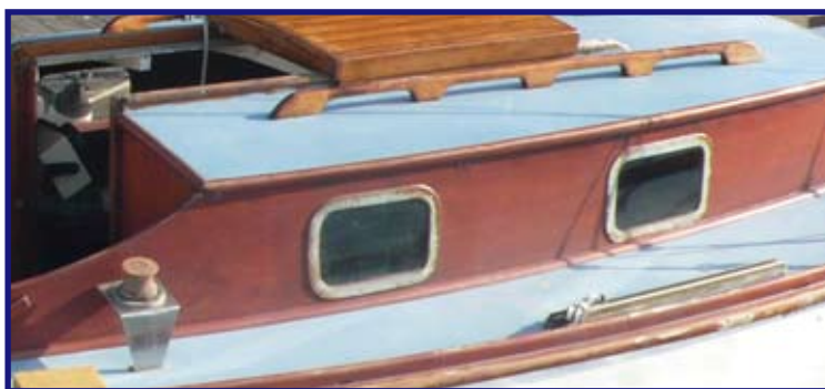
Puffin (1)