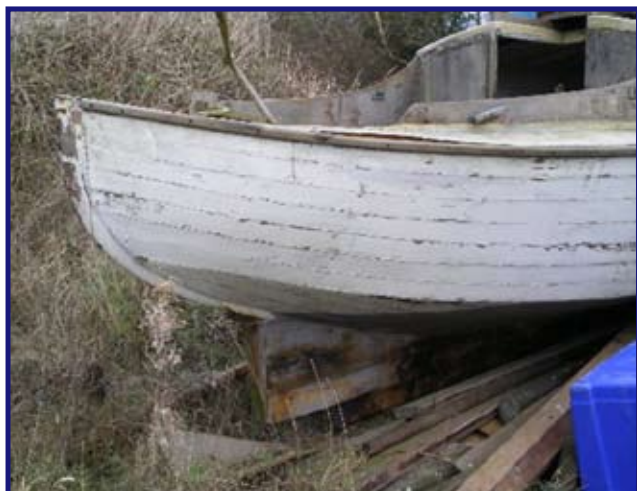
Puffin (2)